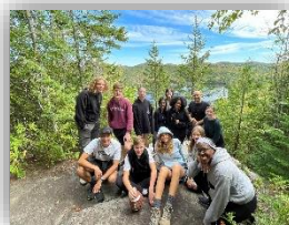
Youth Retreat Hike