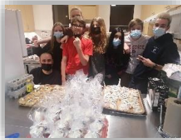
Fundraiser for the Ukraine