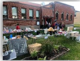
CMP Garage Sale